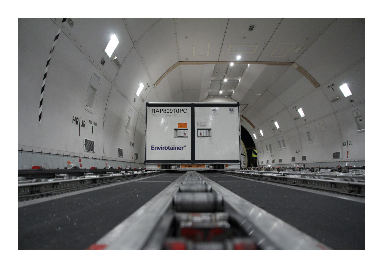
All press releases